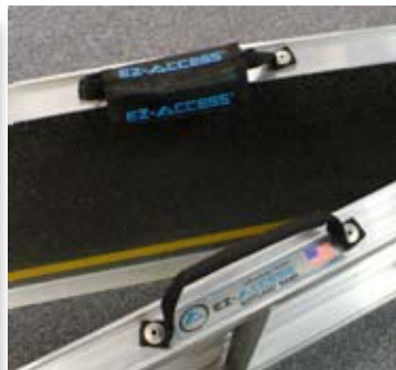
Ergonomically designed flexible, non-breakable handles offer convenient carrying and a comfortable grip