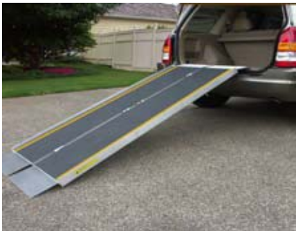
Bottom transition plates adjust to uneven terrain